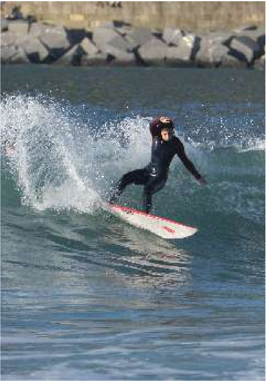
Iur Gi / @iurgiurgi