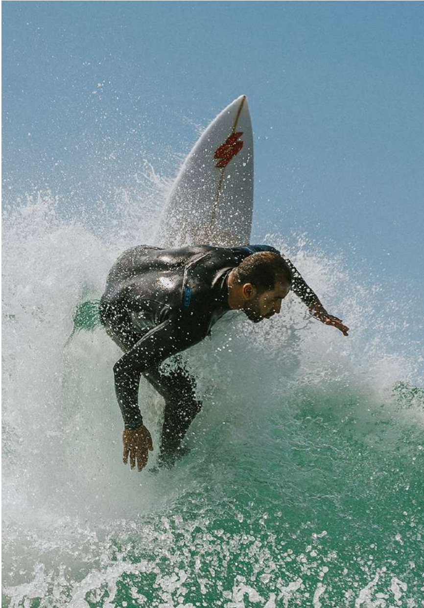
Alvaro Montero/ @alvaromonterophoto