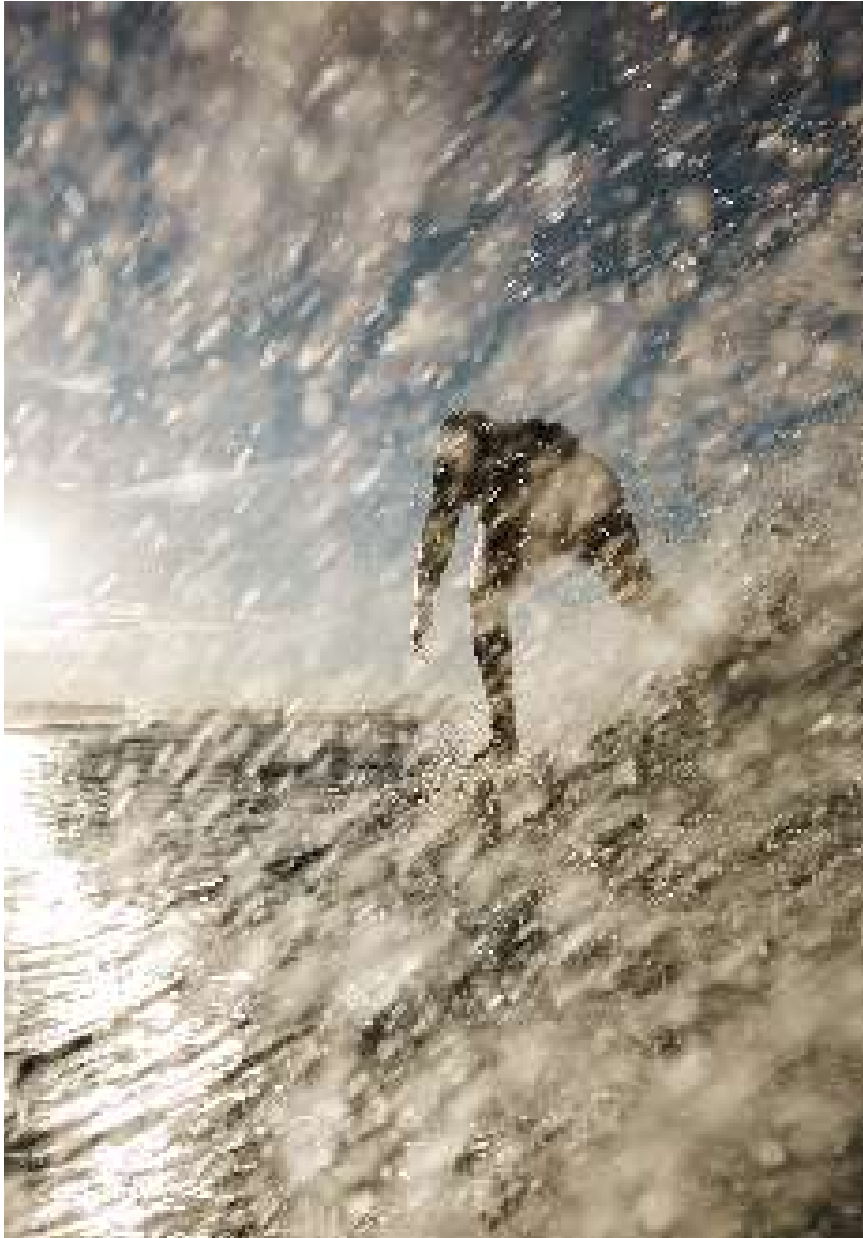
Mintautas Grigas / @mintukass