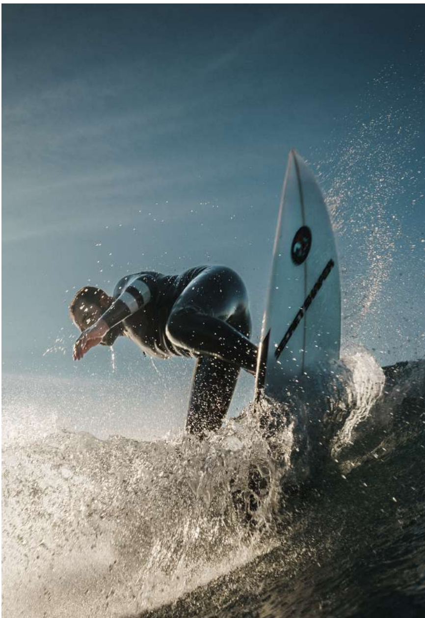
Alvaro Montero / @alvaromonterophoto