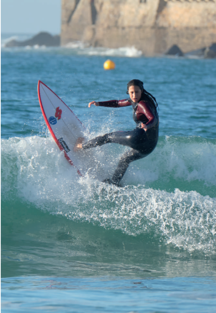
Iur Gi / @iurgiurgi